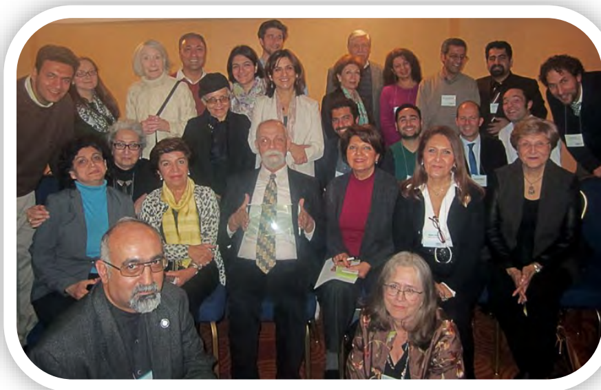
AATP's Lifetime Achievement Award Ceremony, Nov. 22, Washington D.C.